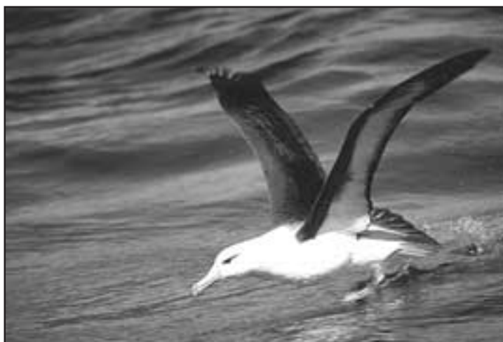
South Africa and Australia help save these magnificent birds

On 6 November 2003 South Africa signed the International Agreement on the Conservation of Albatrosses and Petrels (ACAP) in Canberra, Australia. By this action South Africa became the fifth country to ratify the Agreement, following Australia, New Zealand, Ecuador and Spain.